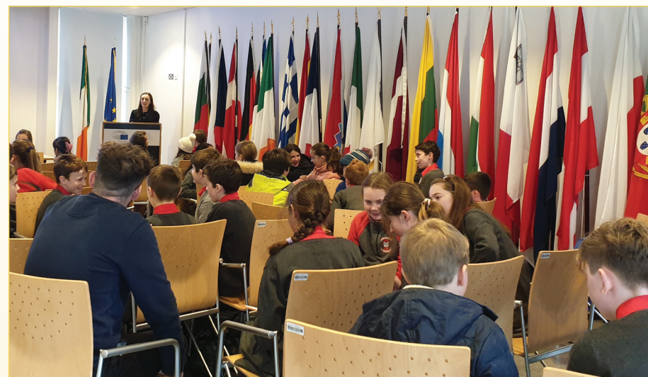
School Visit to the Representation

School groups are welcome to visit us at the Representation to learn about the European Union. A typical visit lasts 90 minutes and may include a presentation, an educational video, a Q&A, and a quiz. Virtual visits are also possible. Email us to book your visit.