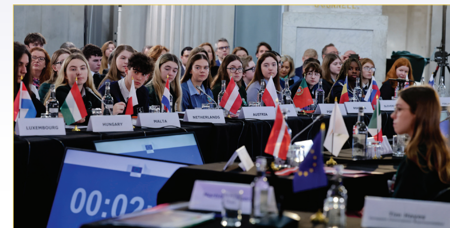
Model Council of the EU, 2023

Is é an Coimisiún Eorpach i gcomhar le Rialtas na hÉireann a eagraíonn an comórtas seo. Is comórtas é le haghaidh daltaí meánscoile in Éirinn, thuaidh agus theas, a bhfuil 15 bliana slánaithe acu ar an 1 Méan Fómhair den scoilbhliain sin agus a bhfuil sé ar a gcumas aistriúchán a dhéanamh ó Bhéarla go Gaeilge, nó ó roinnt eile de theangacha oifigiúla an Aontais Eorpaigh go Gaeilge. Seoltar an comórtas i mí na Samhna/mí na Nollag gach bliain agus is san earrach a bhíonn Lá an Chomórtais.