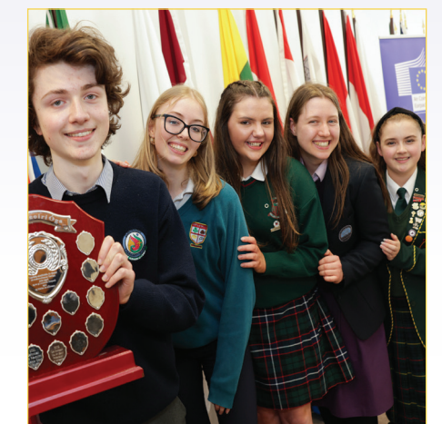
Buaiteoirí Aistritheoirí Óga 2023