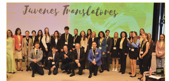
Buaiteoirí Juvenes Translatores 2023

This annual translation competition is open to students across the European Union who are 17 years of age and who have the ability to translate between any two of the EU's 24 official languages. The competition is launched in September each year. All entries are then entered into a random draw and 705 schools are invited to proceed to the next stage. The final number of participating schools per country is equal to the number of MEPs representing that country – i.e. 13 for Ireland. The winners - one per country - are announced in early February and prizes are normally presented at a special ceremony in Brussels during the Spring.