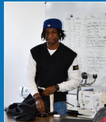
Visitors to SCFE can meet teachers and see students' designs take shape in the Fashion Studio