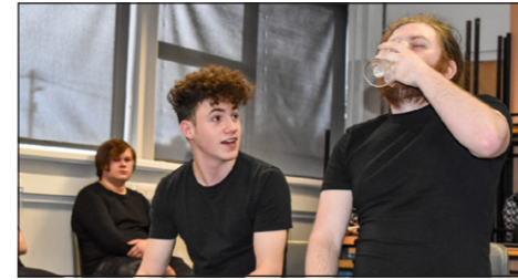
Performing Arts Students delighting the visitors at SCFE Open Day